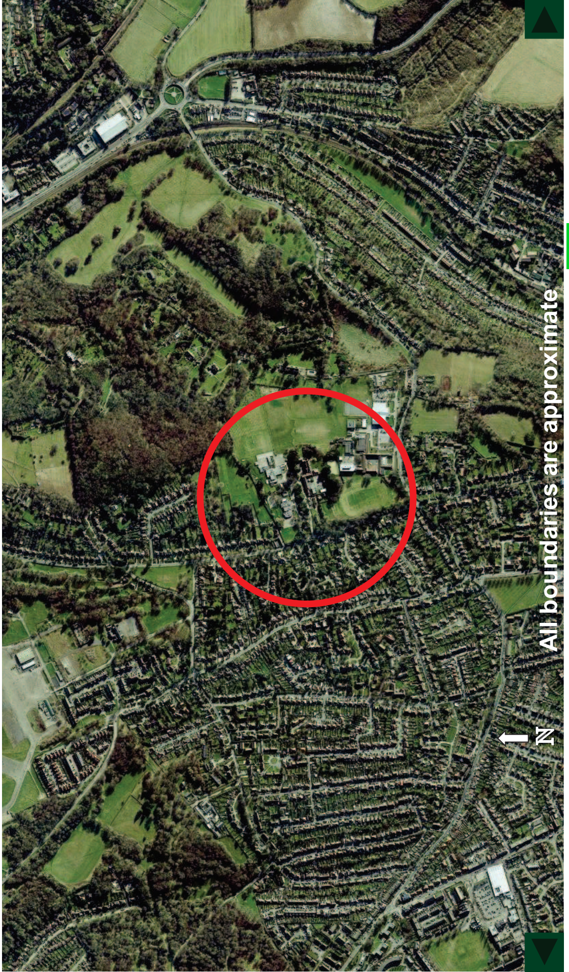
Aerial 1 : Land at St Francis RC Primary School