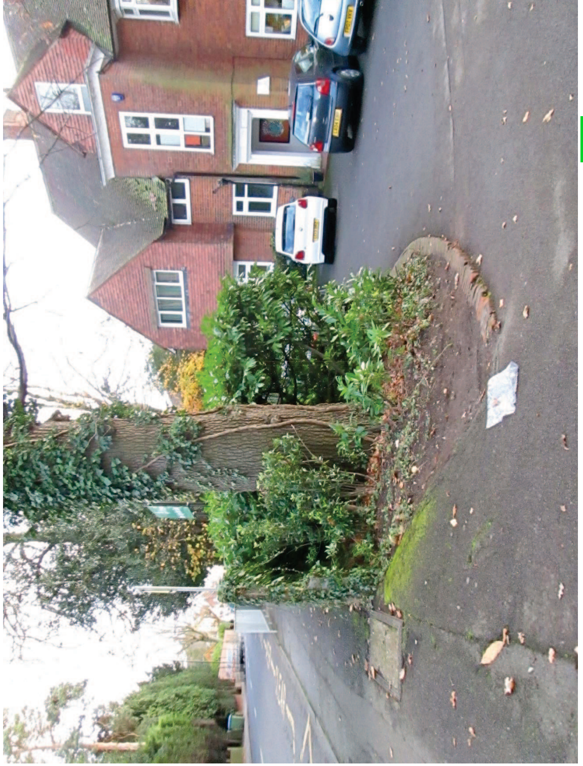
Figure 1 : Lodge building and existing staff car park, viewed from Queens Road