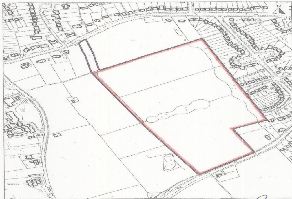
Map A "Plan of the Land"