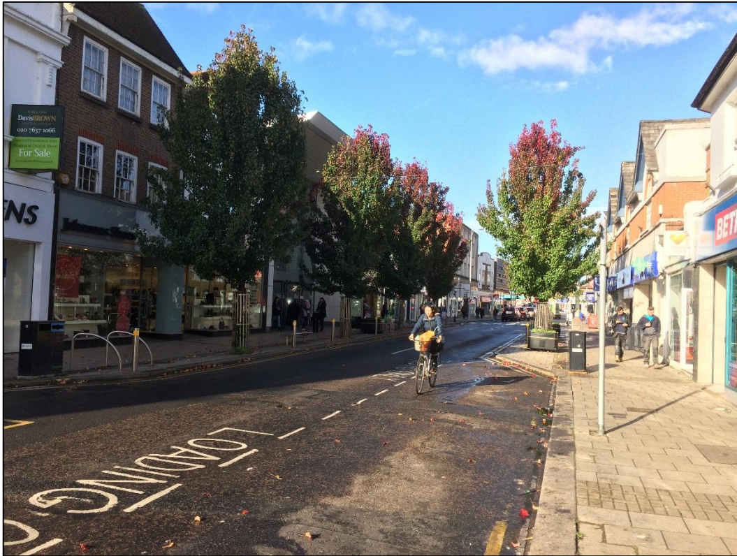
Figure 2: Footway build outs outside The Heart shopping centre.