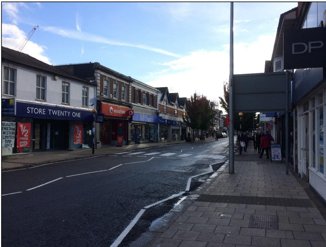
Figure 1: North-east zebra crossing.

The visibility to the zebra crossings is affected by the existing parking arrangements as well as street furniture on the footways, including trees and planters.