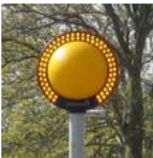
Figure 2. Example of a Zebrite beacon.

This options looks at replacing the existing belisha beacons with zebrite beacons. Zebrite beacons would improve conspicuity of the crossings.