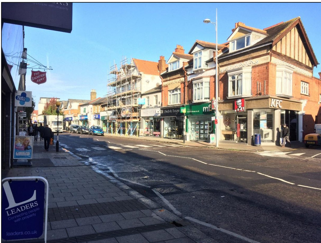
Figure 3: South-east zebra crossing.