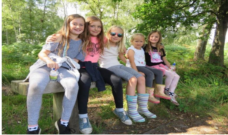
Wheel of Well-being