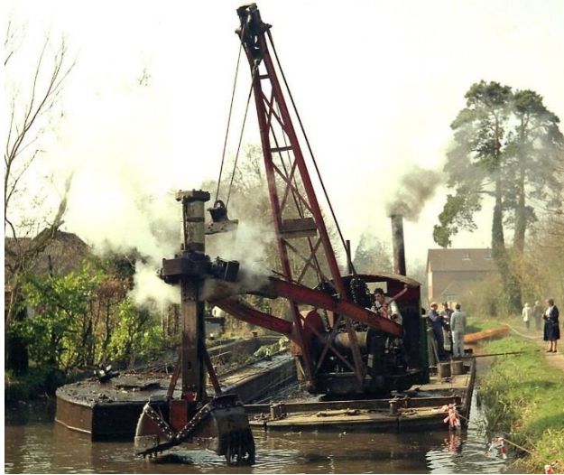
Steam dredger “Perseverance”