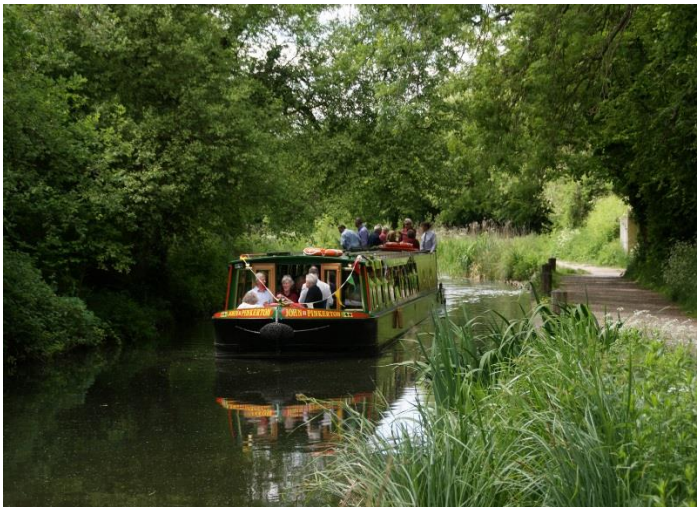
John Pinkerton II canal cruises

The Canal Society, BCA and the Basingstoke Canal need all Councils to play their part in maintaining this unique and wonderful asset for residents and ratepayers to continue to enjoy for the future.