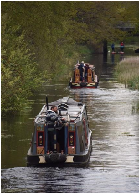
Paddleboards and Boats on the Vibrant Basingstoke Canal

As the "Guardians of the Canal" and the original instigators of the project to reopen and rejuvenate the Basingstoke Canal (an event that celebrates its 30 th anniversary this year), the BCS is committed to the vision of "Keeping the Canal Alive and Vibrant" for the enjoyment of all along its 32 mile length (37 miles, if the last 5 miles between Greywell and Basingstoke is taken into account).