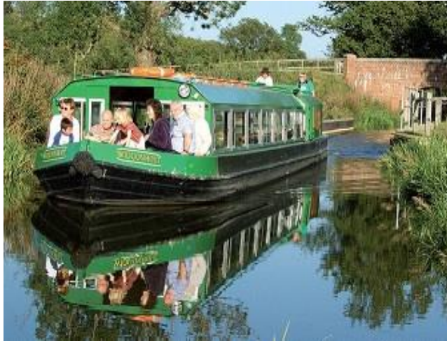
Electric canal boat Wey & Arun