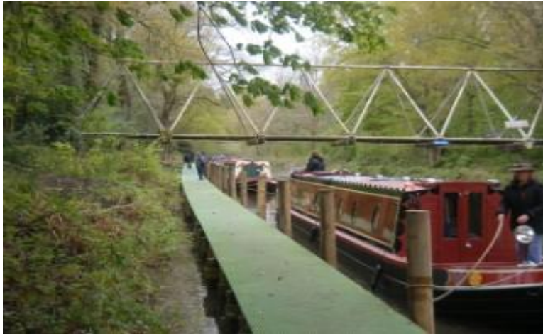
New Holland Moorings at