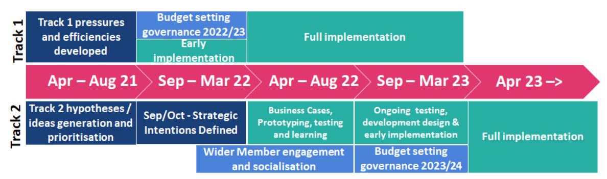
Figure 1: 'Twin Track' approach