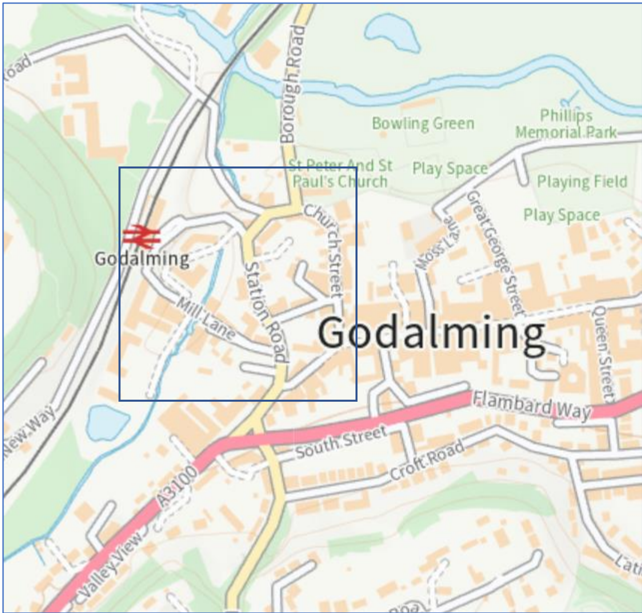
Feasibility Design (also shown in Annex 1)