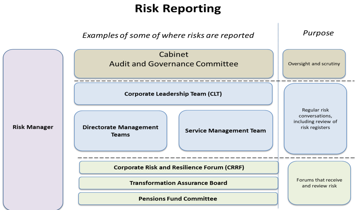
Fig 6 – Overview of some of the stakeholders that require risk information

It is IMPORTANT that anyone providing a risk report understands that there may be content which could be confidential. For example, the mitigations may cover commercially sensitive information or could be used to by-pass intended safeguards. Therefore, there must be a clear understanding of why the report is needed, what content requirement / risk information is needed, and who will have access to the report.