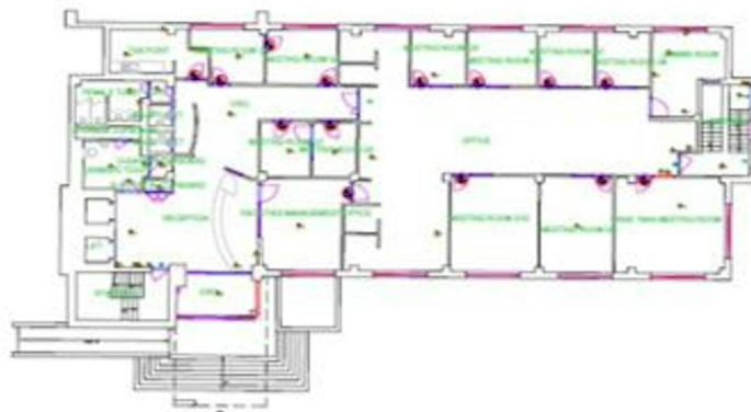
Main Building Ground Floor Main Entrance