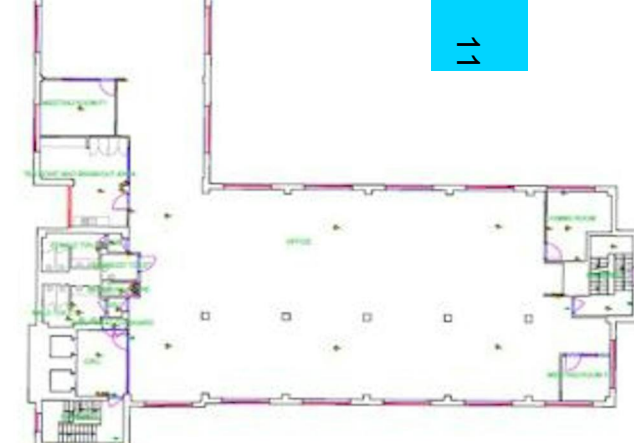
Main Building First Floor