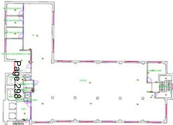
Main Building Second Floor