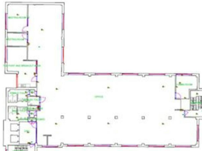
Main Building Third Floor