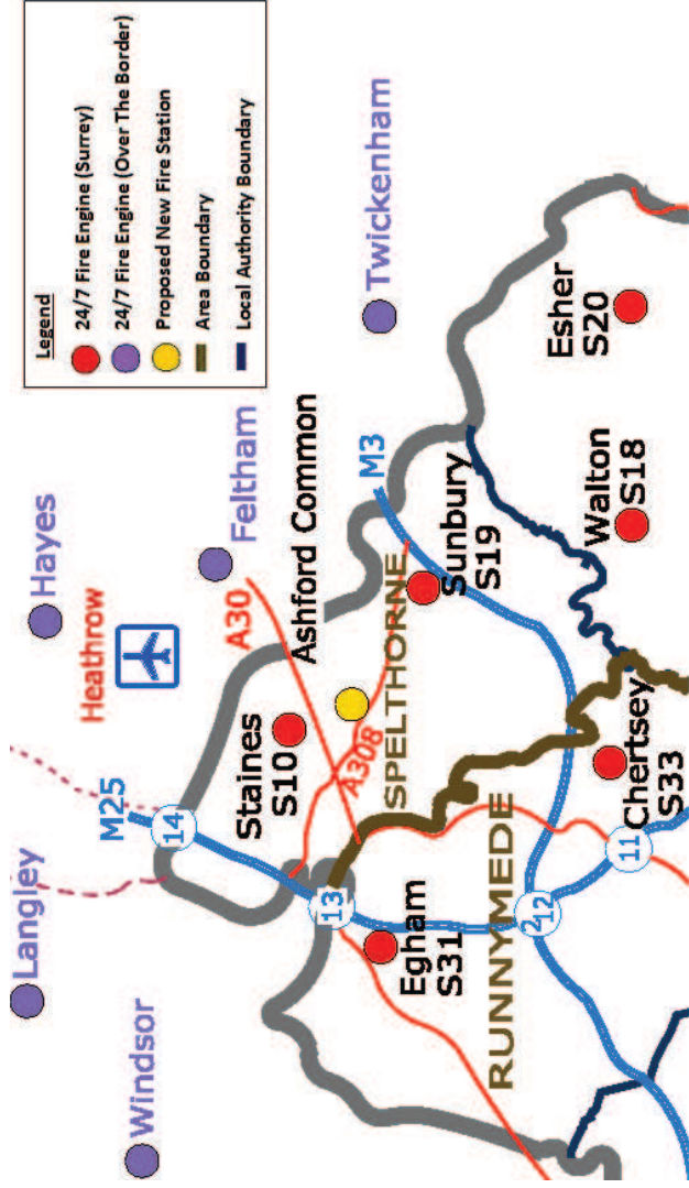
Map showing current stations and indicative position of proposed station

If you would like this information in large print, Braille, on tape or in another language please contact us.