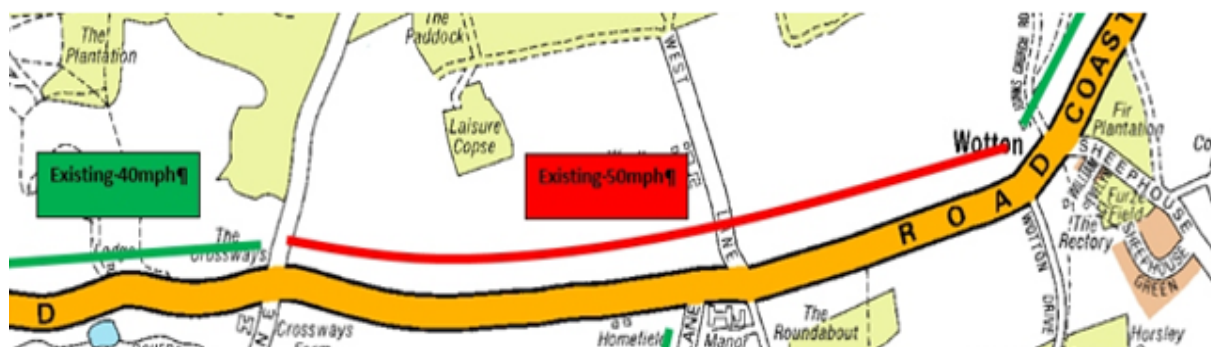
Heading Westbound from Dorking Guildford