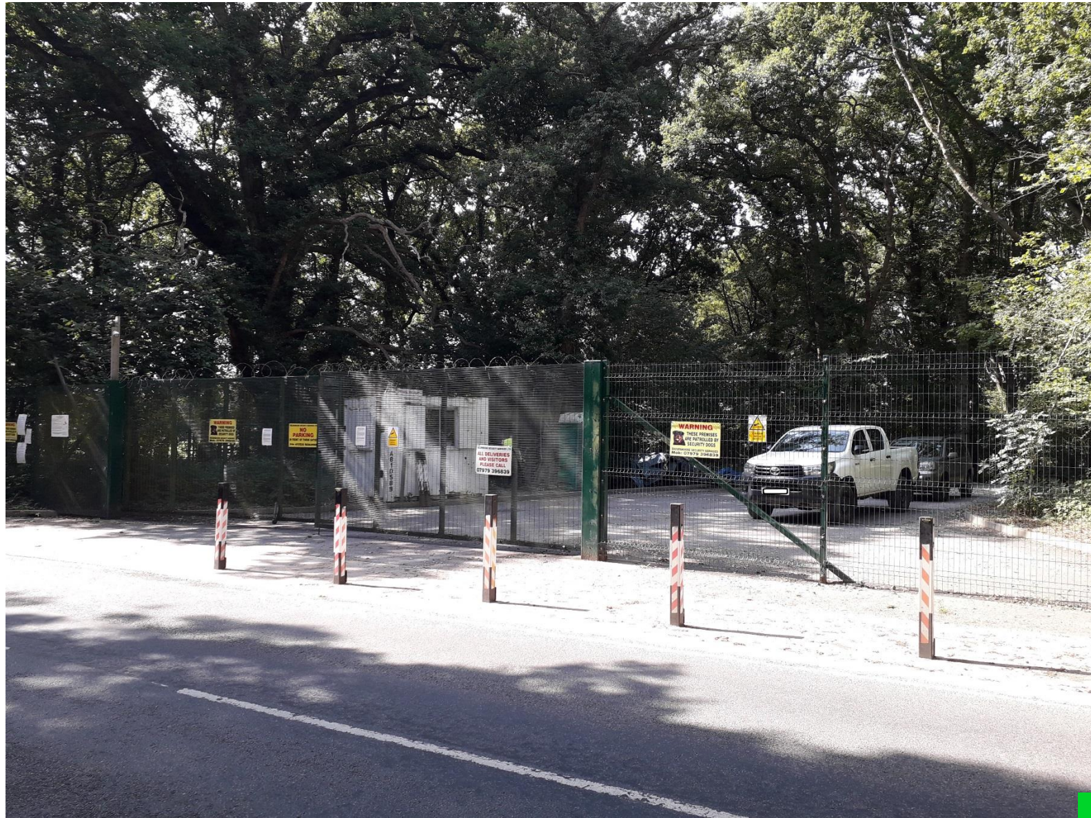
Figure 1 – The existing wellsite access on Horse Hill