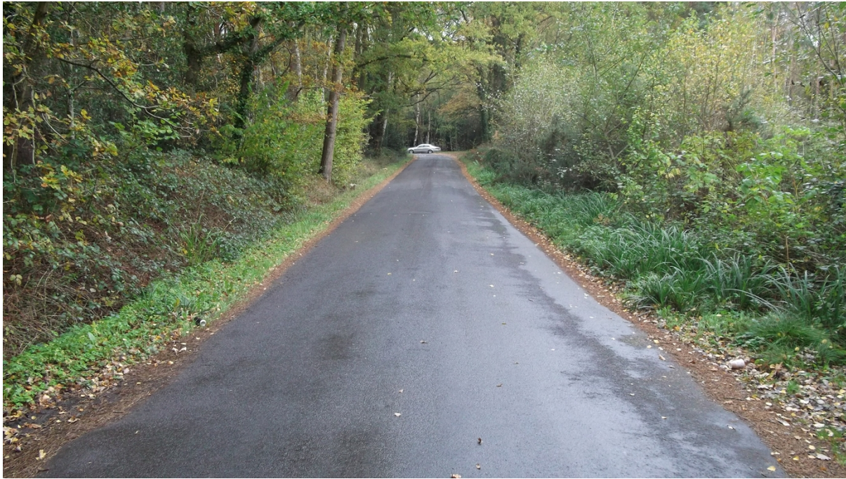
Pic 2. Northern most part of Horsell Common Road – vehicle in distance is on the A3046.