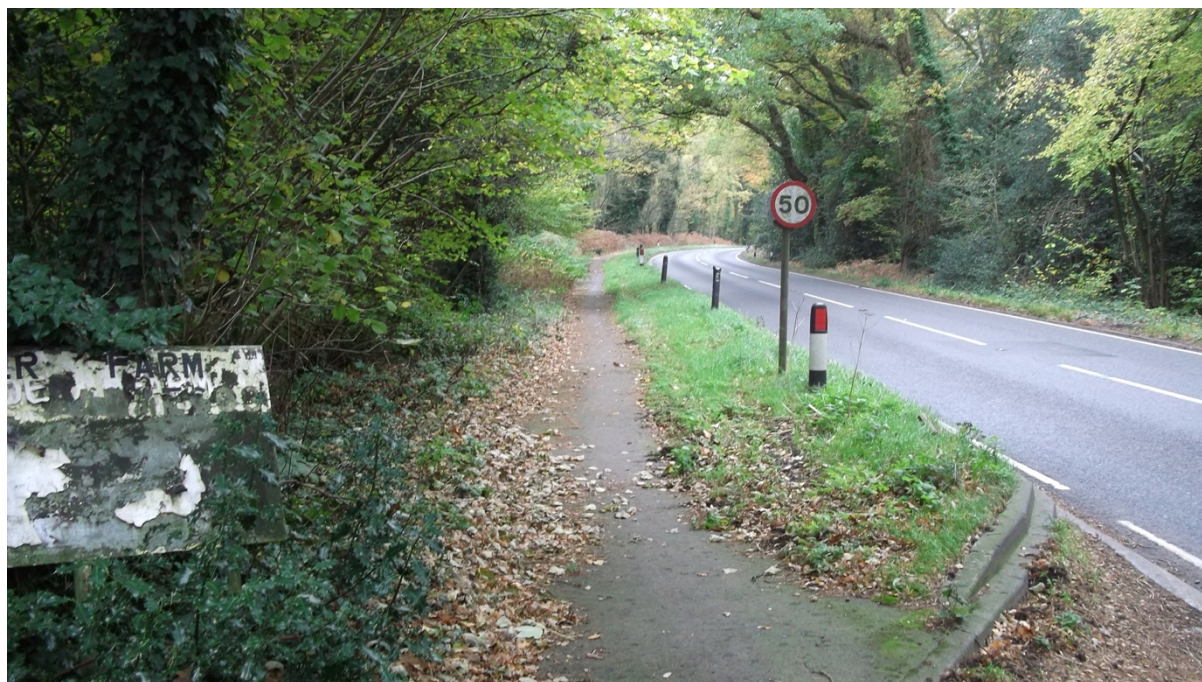
Pic 1. From entrance to Border Farm looking towards Chobham.

footway and clearing away any encroachment of soil and grass etc. but a considerable length of footway would need to be treated for any real benefit.