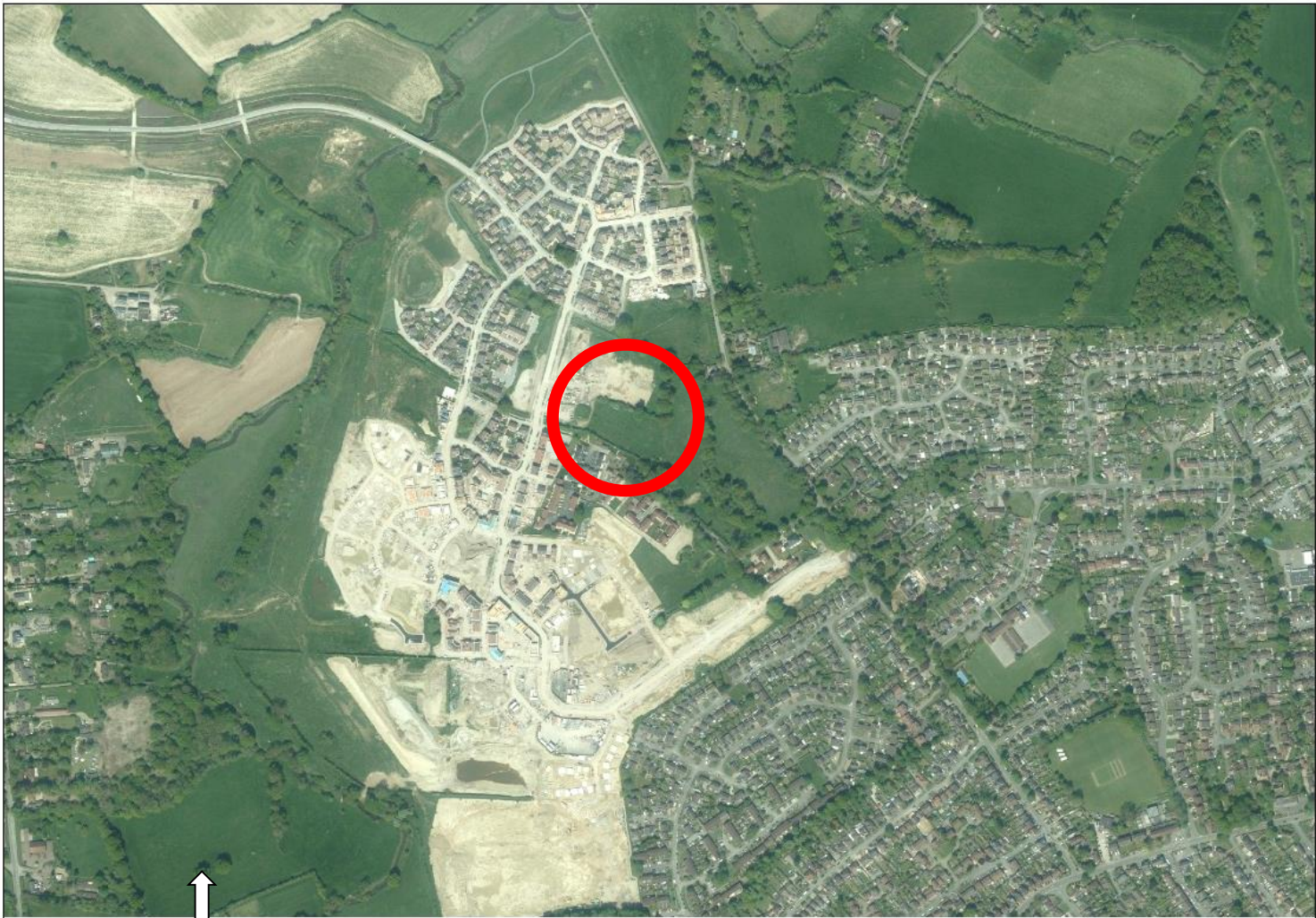
Aerial 1 : Westvale Park Primary School, off Webber Street, Horley