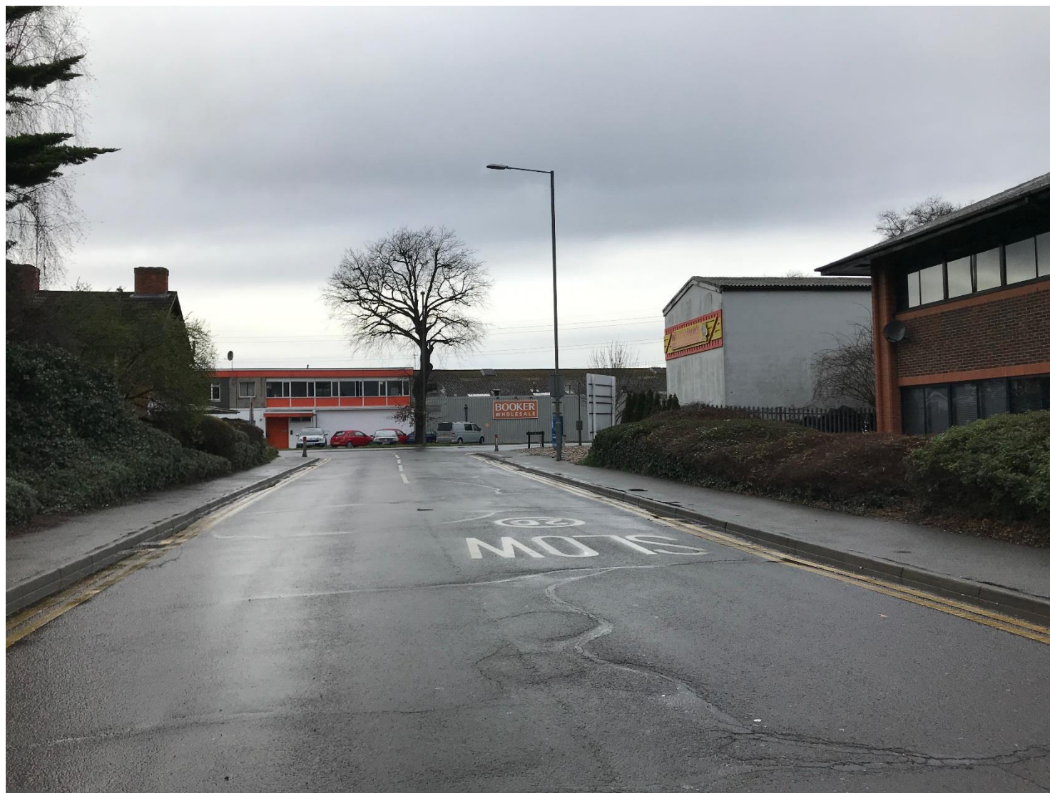
Photo 15: View of the approach from Wintersells Road of the access with the A318 Oyster Lane, looking west.