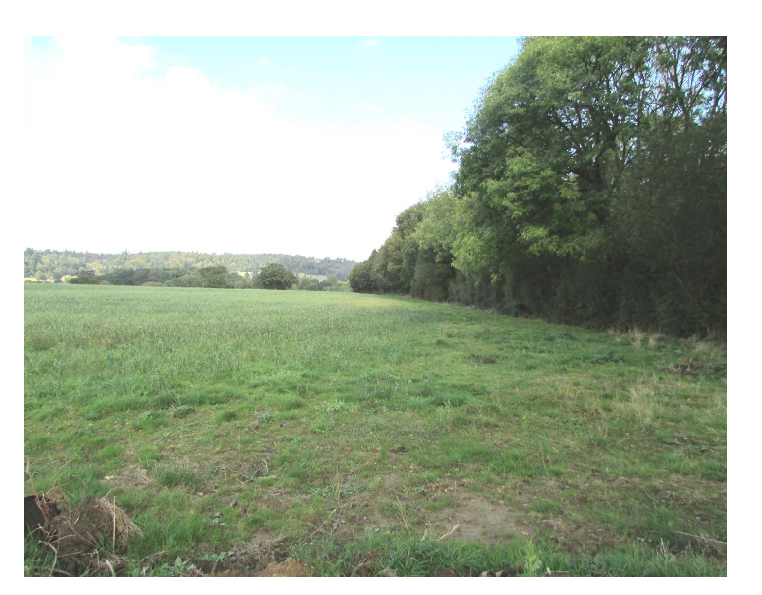
Figure 4: Western Boundary of Burchetts Woodland Block Looking North