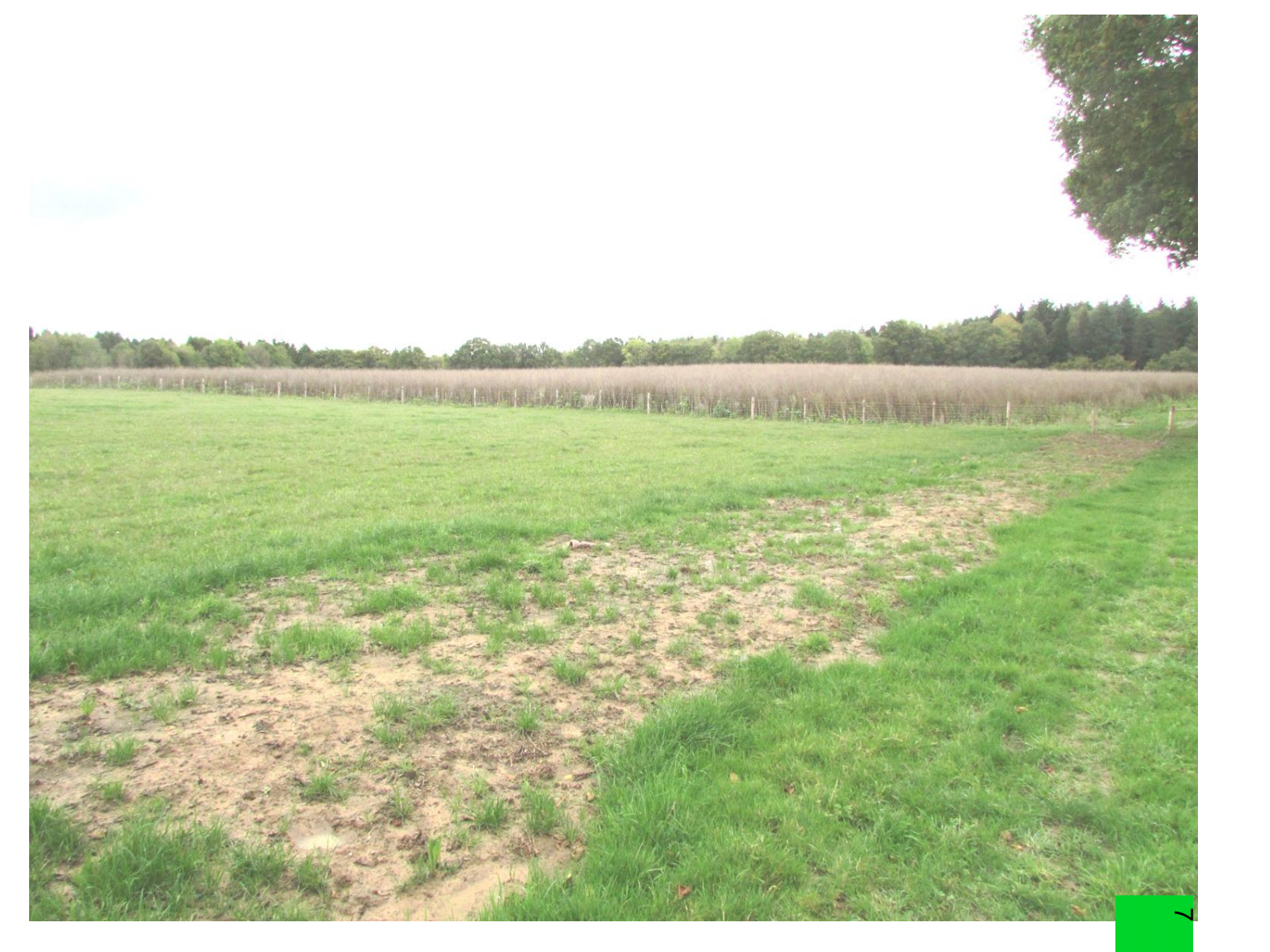
Figure 1: Well Site Host Field Looking North East