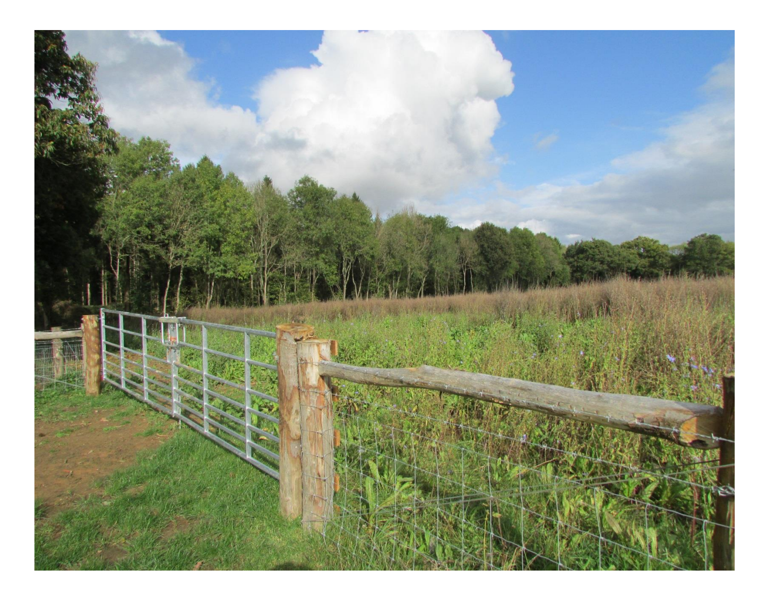
Figure 2: Vehicular Entrance to Well Site Compound Looking North East