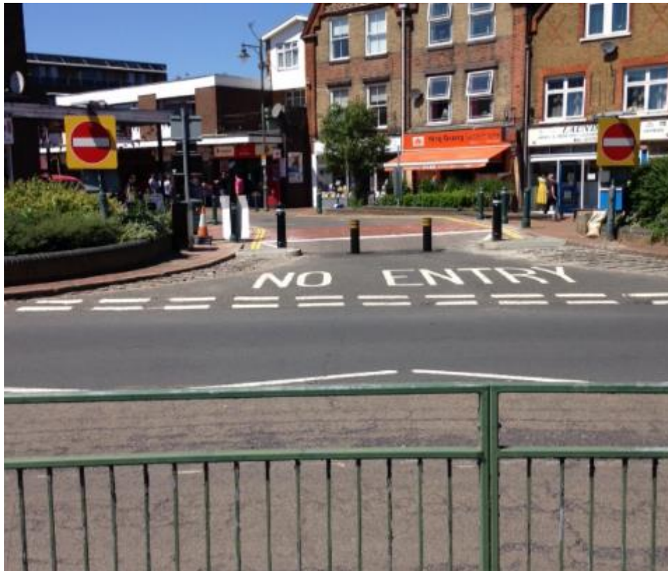
Exit point for vehicles on Egham High Street