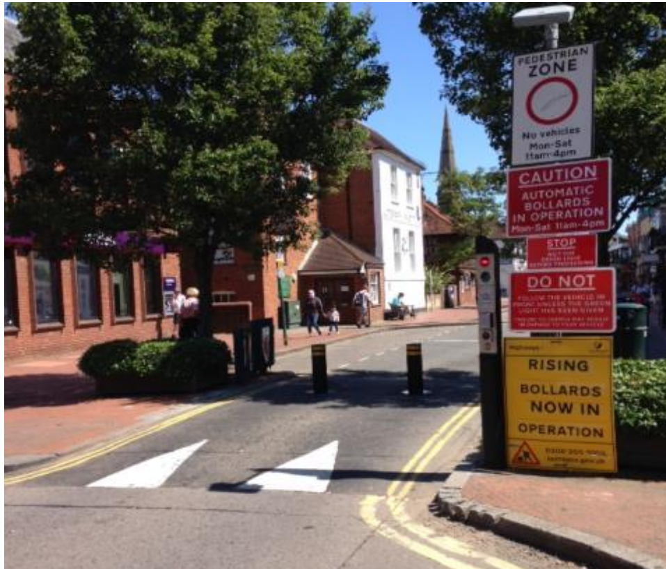
Entry point for vehicles on Egham High Street