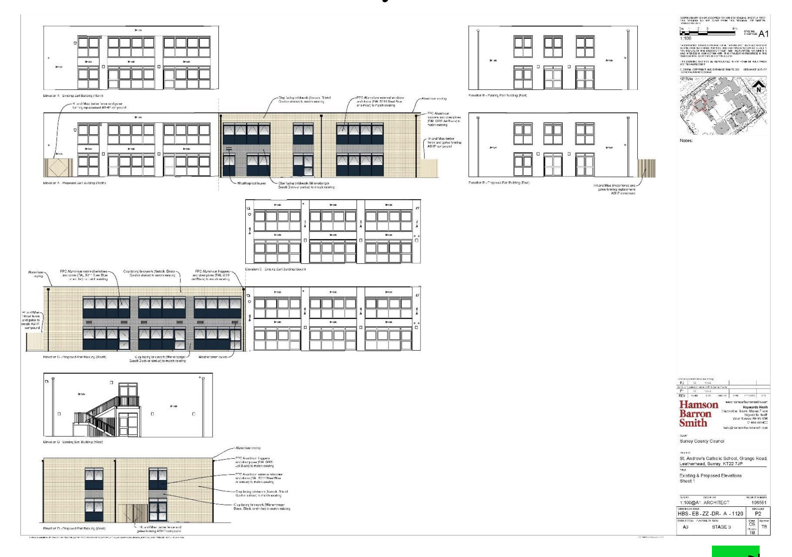
Figure 2 Existing and Proposed Elevations Sheet 1 dated 10 May 2021