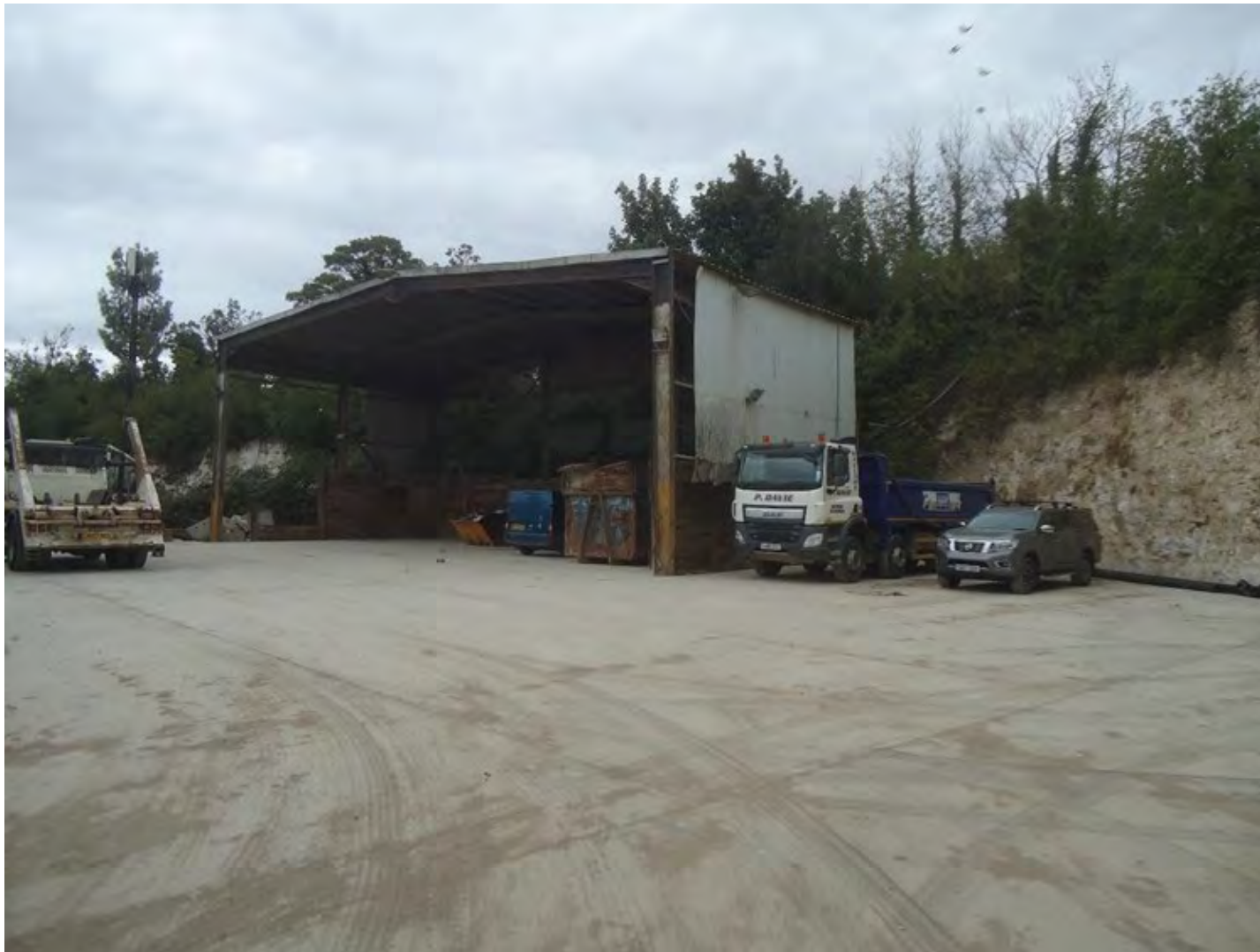
Figure 4 : Photograph showing unauthorised concrete hardstanding