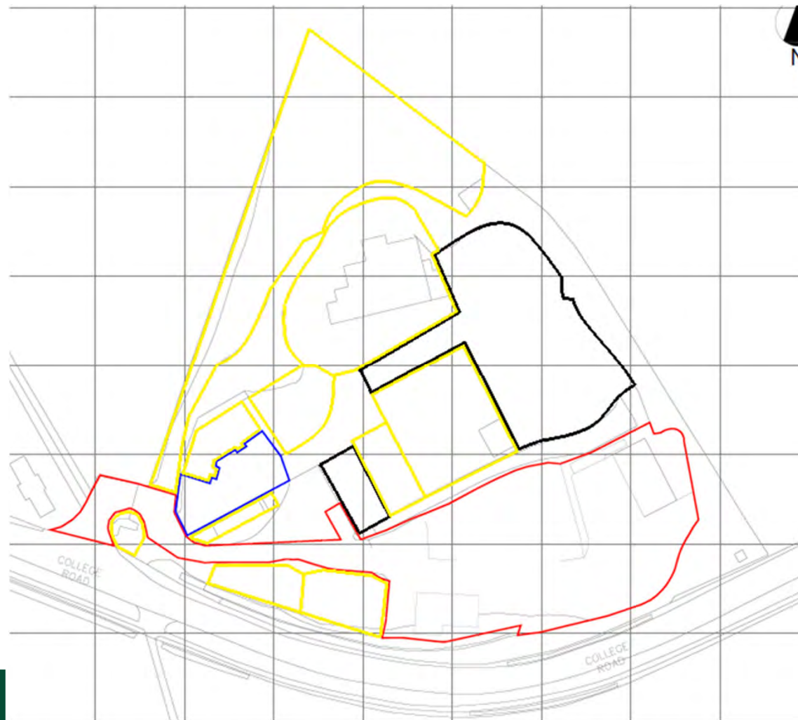
Diagram of areas on the wider Chalkpit site