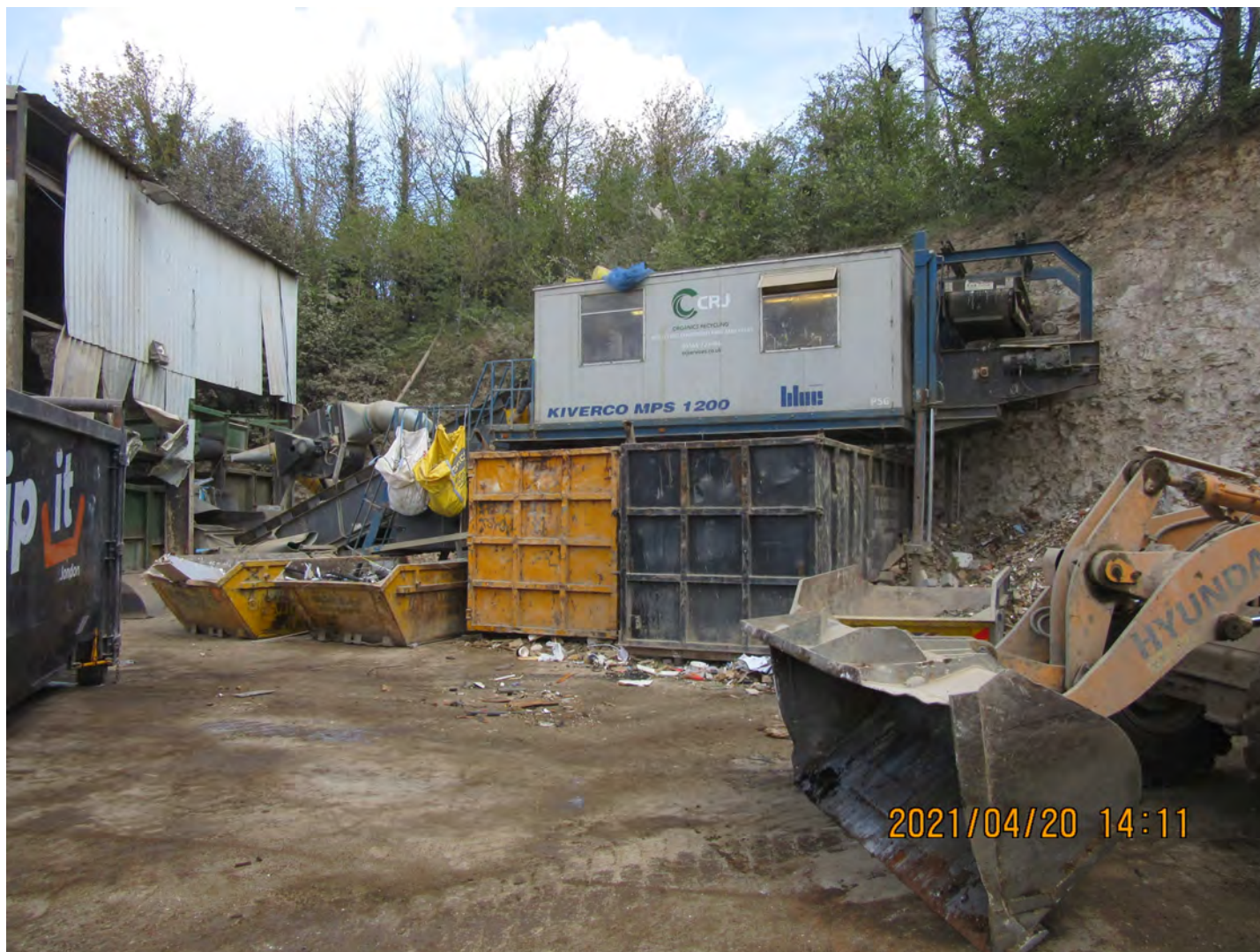
Figure 8 : Photograph showing unauthorised mechanical picking station