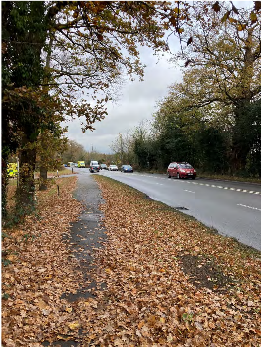
Photo 1 – Looking northeast along Guildford Road (A320) (ambulance station to the left)