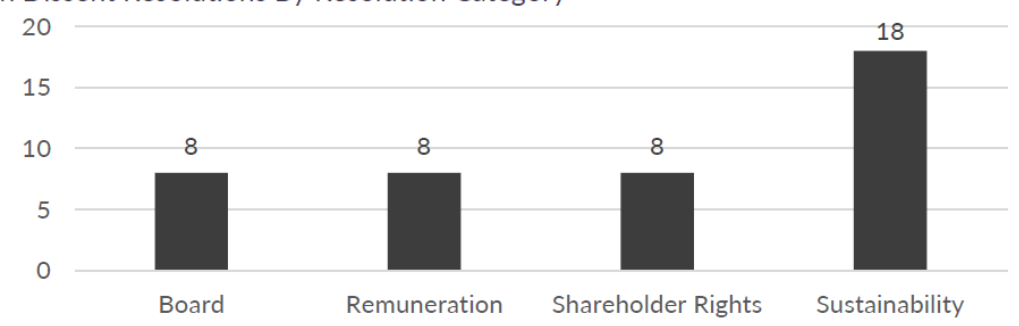
High Dissent Resolutions By Resolution Category