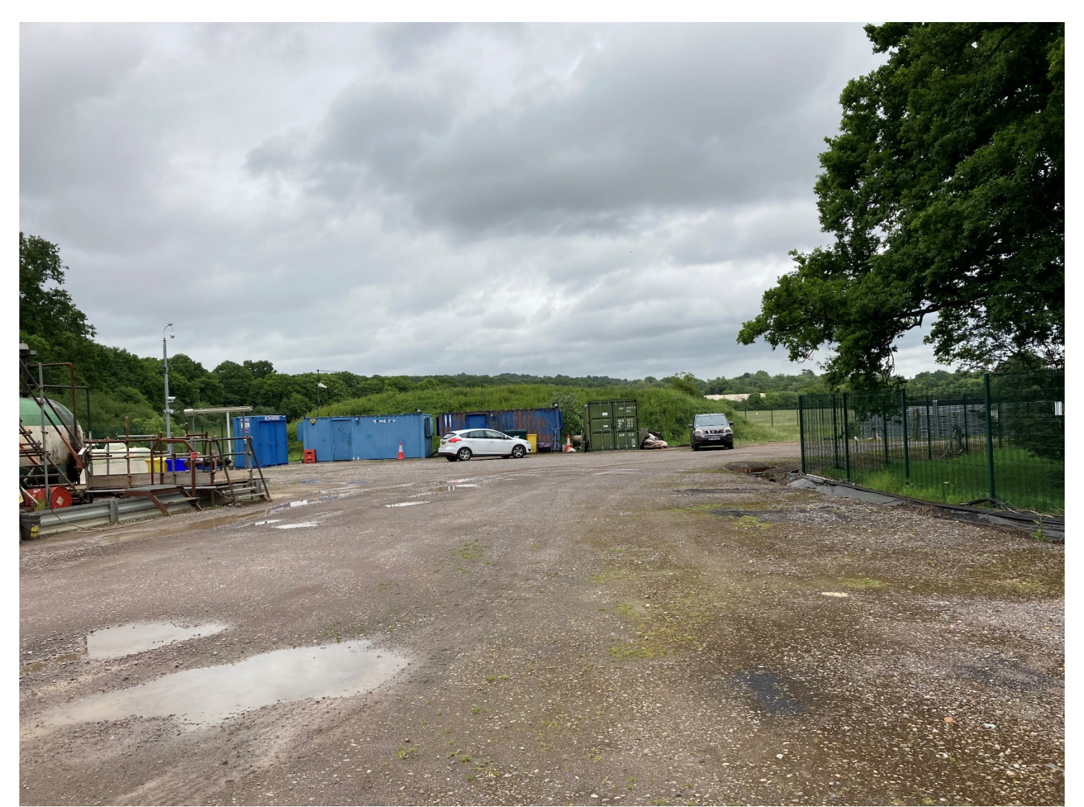
Photo 6 : Bletchingley Central looking north eastwards at existing on site cabins