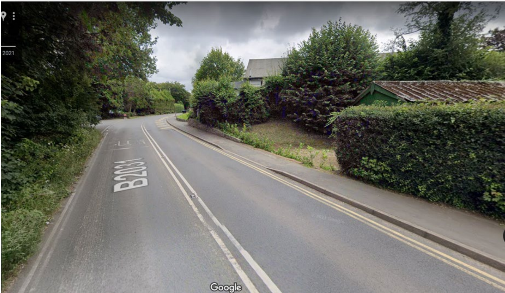
Photo 1: Approaching the school from the west on Rook Lane (B2031)