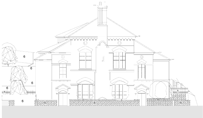
2 Elevation 2 - a 1 : 100