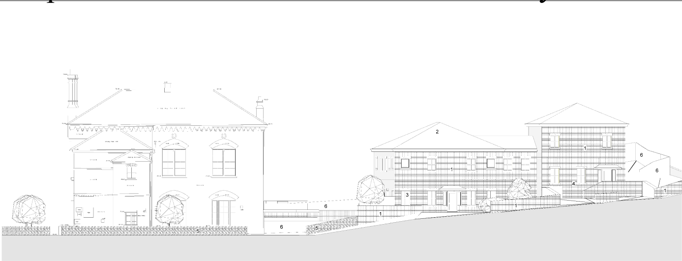
3 Elevation 1 - a 1 : 100