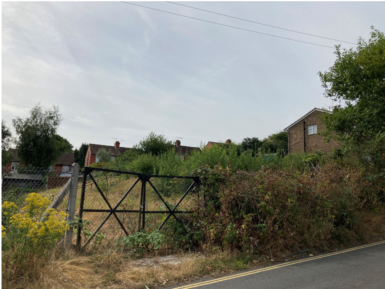
Figure 8 : Existing site access off Marlborough Hill to be relocated