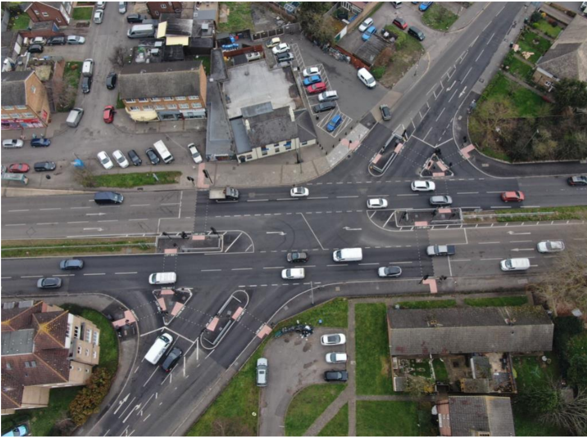
The Black Dog Traffic Signal Improvement